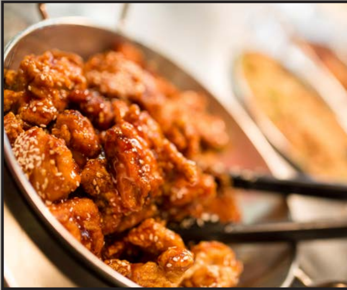
Golden Corral of Joplin 2415 S. Range Line • Joplin, MO 417.625.1684

Enjoy all-you-can-eat hot and cold buffets, bakery, desserts, soft-serve and hand-dipped ice cream, and a chocolate fountain. Open weekends for breakfast from 7:30-11 am. Serving made-to-order omelets and so much more. Enjoy the Great Steak Buffet after 4 pm weekdays and on weekends from 11 am-close. Party room, catering and kids' menu available. $-$$