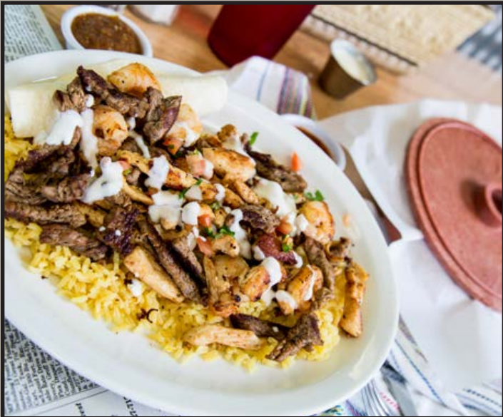
Mexican Way 1721 La Questa Drive • Neosho, MO 417.455.6985 • 417.455.0058

Hours: Tuesday-Thursday, 11 am-9 pm. Friday-Saturday, 11 am-10 pm.