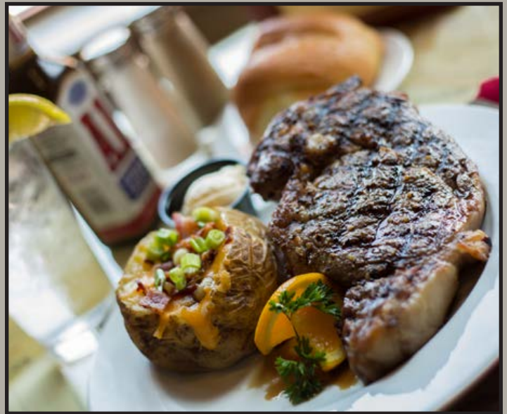
Bootleggers Restaurant & Brewery 101 S. Madison Ave. • Aurora, MO 417.308.3504

Hours: Monday-Thursday 10:45 am-9:00 pm • Friday 10:45 am-9:30 pm Saturday 7:30 am-9:30 pm • Sunday 7:30 am-8:30 pm